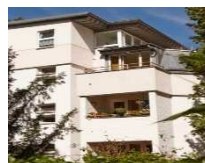
HEERSTRASSE BERLIN WESTEND